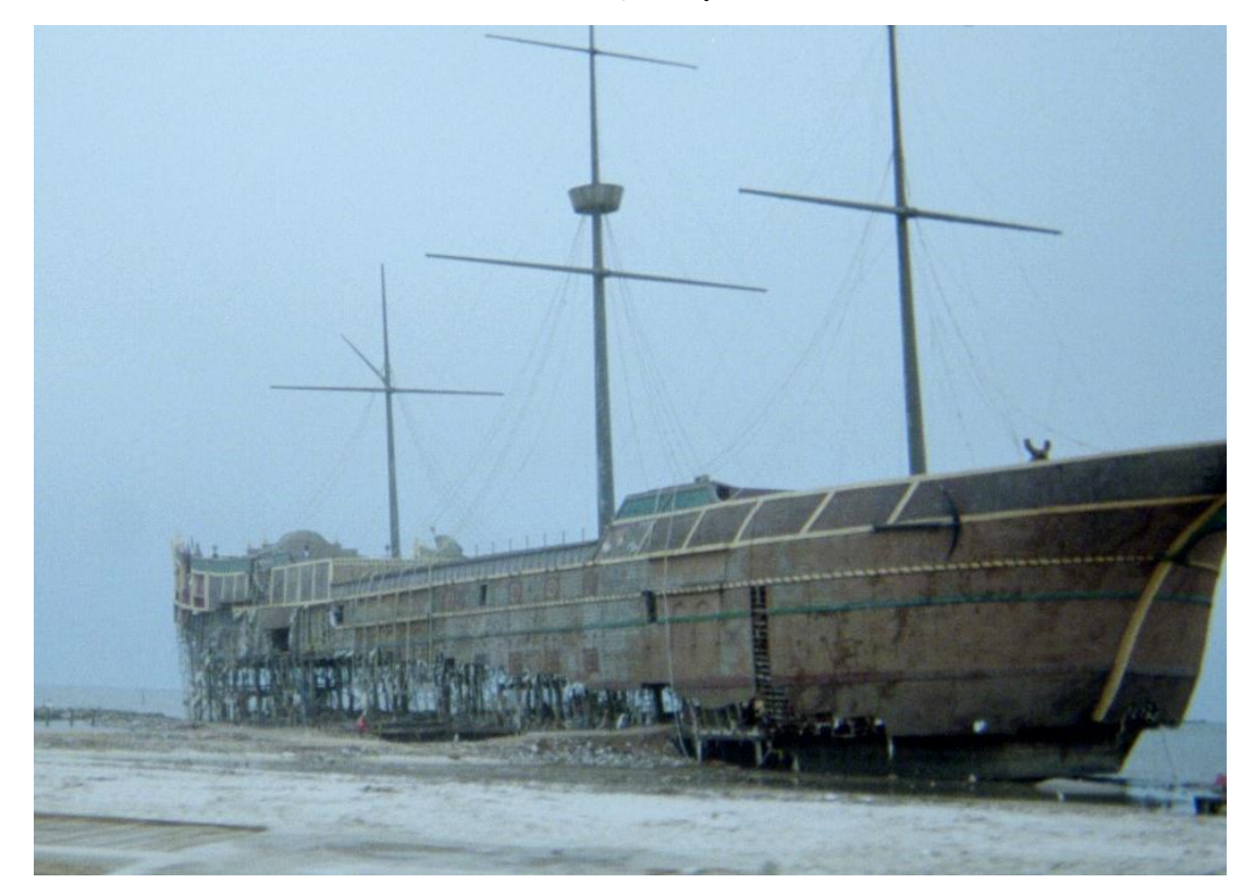
The gutted remains of Treasure Bay Casino, beached far from its original spot.